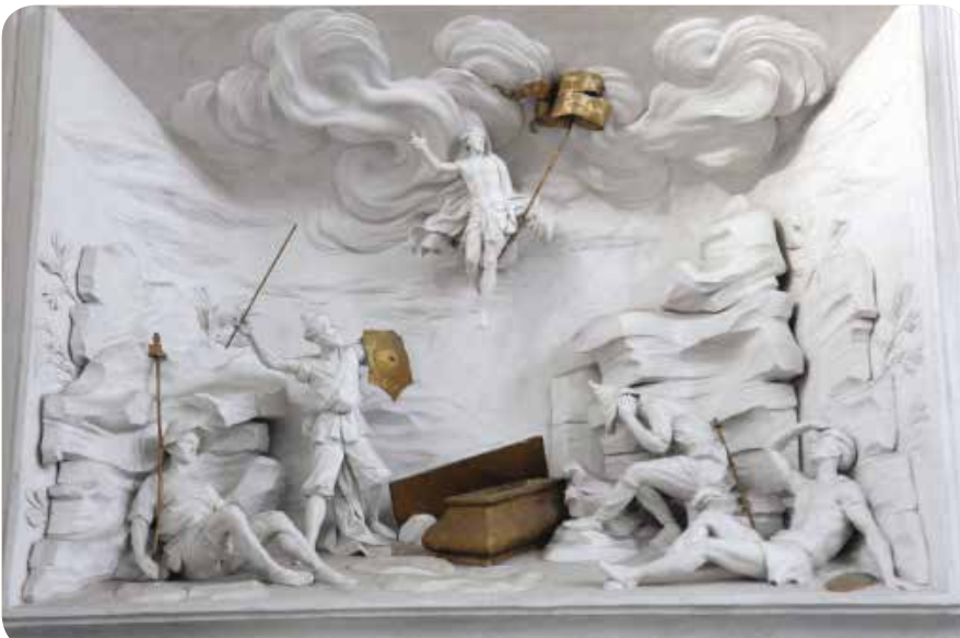
16 Palermo, Oratory of the Holy Rosary in Santa Cita. Detail of a 'Teatrino' depicting the Resurrection