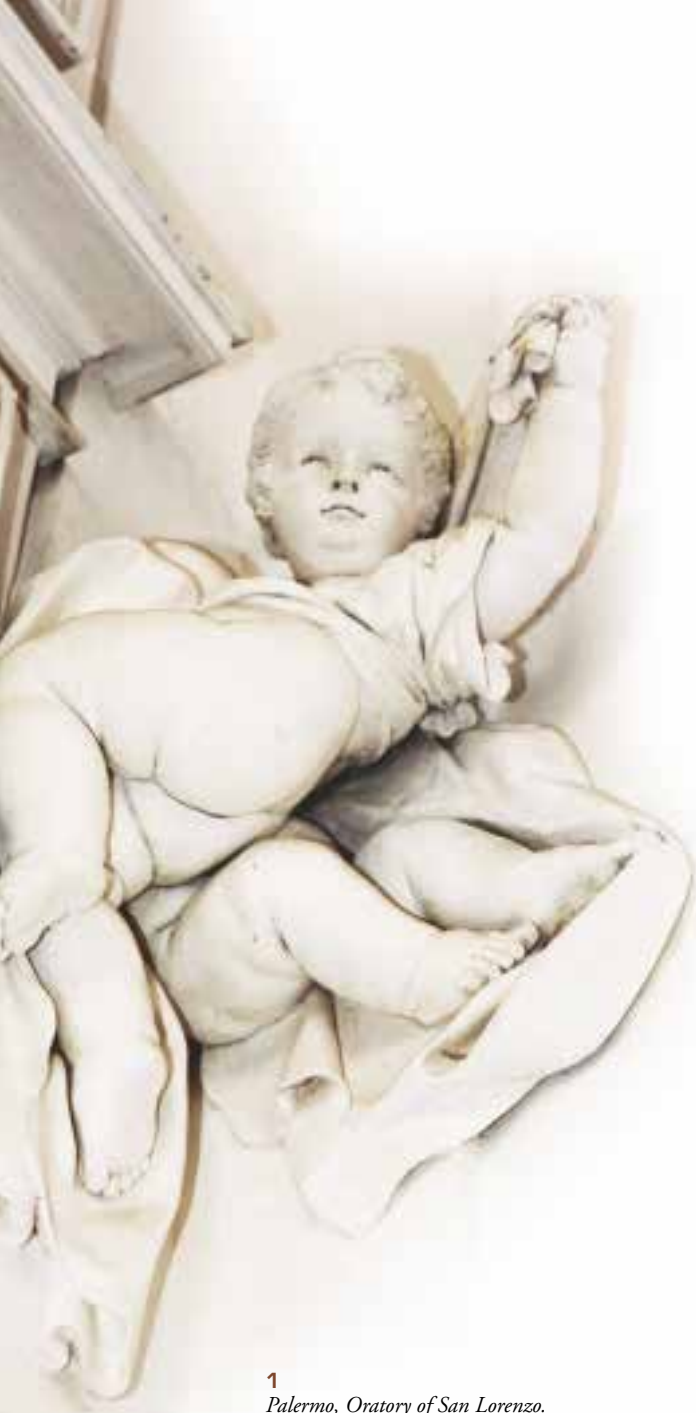
1 Palermo, Oratory of San Lorenzo. Detail