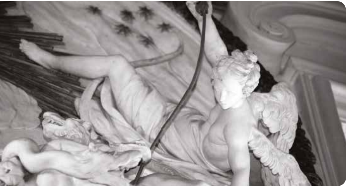
7 Oratory of the Holy Rosary in San Domenico. Details of the medallions