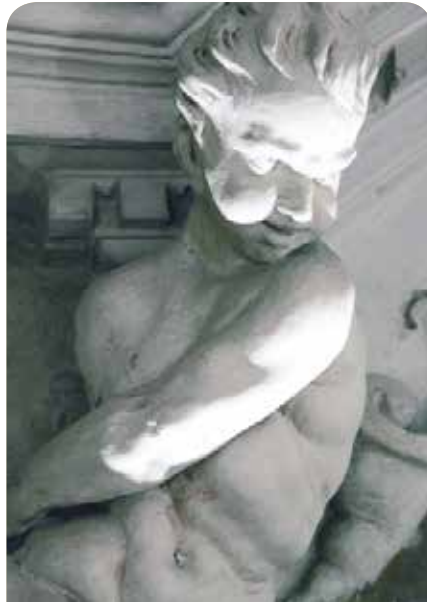
2 Palermo, Oratory of San Giuseppe dei Falegnami. Detail

Giacomo is still working on the project for the triumphal arch and the small apse in 1717. On the entrance wall, under a drapery supported by a multitude of putties, there is a relief with the famous naval battle. Above, the Virgin hovers as she hands the Sacred Rosary to Saint Domenic, whilst below, two young people, a Christian and a Muslim, look on, embodying the eternal conflict between winners and losers. The decoration of the Oratory continues on the walls in which the so-called "Teatrini" (small-scaled plastic theatres) are located, or perspective panels in which several subjects are depicted making gestures and movements appropriately chosen to allow the artist to narrate the glorious mysteries of the Rosary (those moments in the life of Christ and the Madonna which are recalled during the prayer of the Rosary).