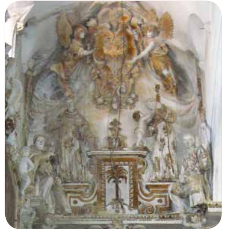
41 Ciminna, Mother Church. Drapery over the Tribune

The simulation of sumptuous fabrics of the era in the “drapes” and “canopies” suspended by groups of angels, in order to conceal the naked wall surface, becomes a prelude – typical of Baroque art – of the need to meticulously fill empty spaces ( horror vacui ).